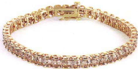
One Carat Diamond Tennis Bracelet - 536 Points