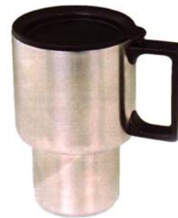
Stainless Steel Coffee Mug - 9 Points