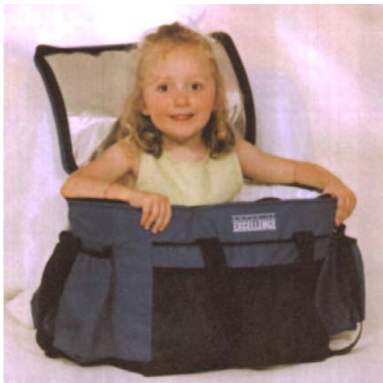
Jumbo Cooler Chest - 27 Points